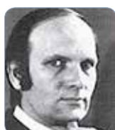
John R. Schrieffer (Physics) U.S.A.