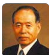
Ryoji Noyori (Organometallic Chemistry) Japan